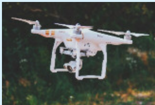
Self-reinforced composite fabric

Support new mobility challenges: find new smart materials for ergonomic, light and durable parts!